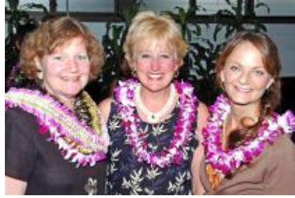
Our World-Famous Dental Team