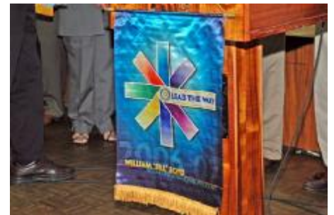
"LEAD THE WAY"