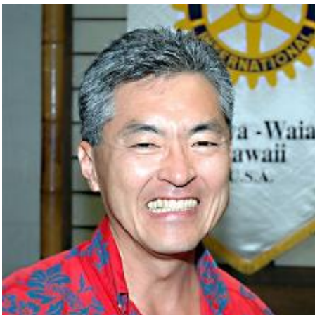
but at the Kapiolani Bandstand on this com-