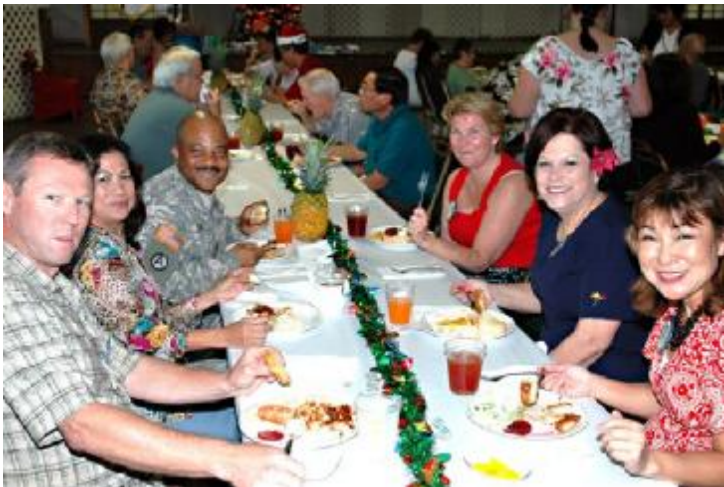
Rotarians having a great time!

No sooner had lunch ended, magic seemed to fill the air, and with a “Ho Ho Ho”, Santa Claus strolled into the room and walked around greeting everyone. He then took his place at the front, and with the help of a few elves, distributed a gift personally to each client in attendance. Many were overjoyed to receive their own gift, especially from Santa himself. It was then announced that a trampoline had been delivered to the ARC Center a couple of days ago, and would soon be set up for the clients enjoyment.