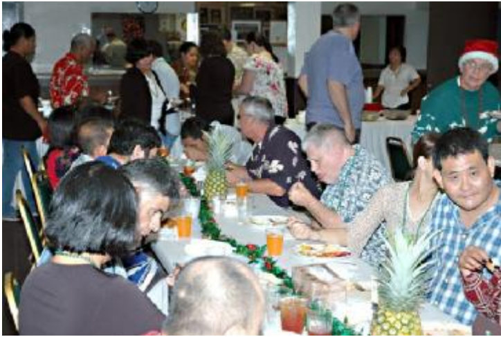
Clients enjoyed a delicious meal prepared by Dot's in Wahiawa