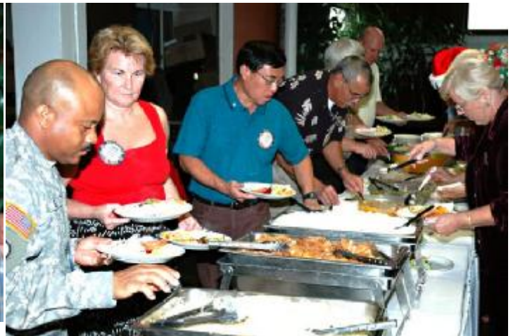
Rotarians served the ARC Clients a delicious meal