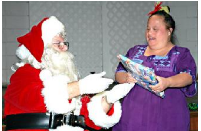
Every guest received a personal gift from Santa