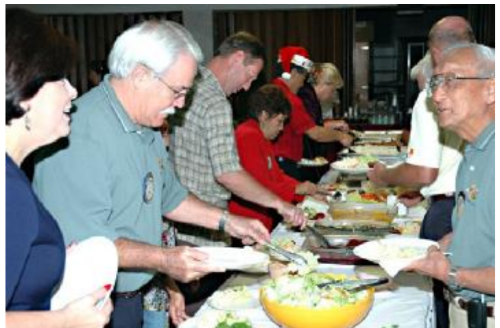
Rotarians even found time to have fun while serving the ARC Clients