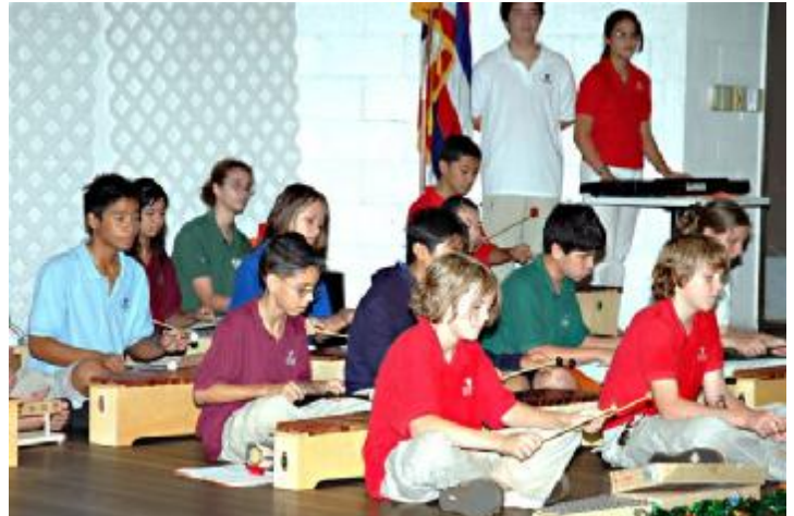
Ho'ala Intermediate School musicians entertained us